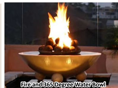
Fire and 365 Degree Water Bowl

Dimensions: 32" Diameter x 9" H. 4.5" Diameter Balls on 18" Diameter Center