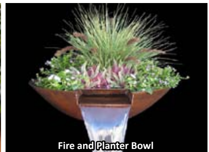
Fire and Planter Bowl