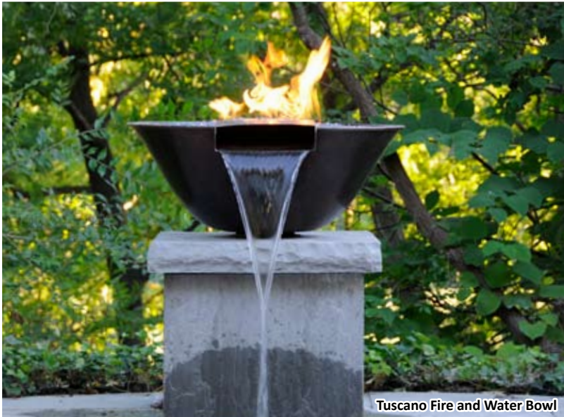
Tuscano Fire and Water Bowl