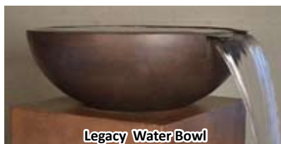
Legacy Water Bowl

Dimensions: 24" Diameter x 36"H x 13" Diameter Base Bowl Option: Water Only