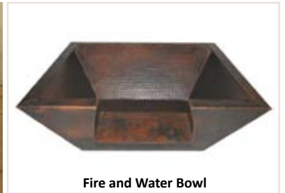
Fire and Water Bowl