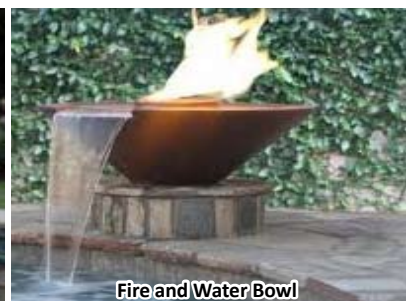
Fire and Water Bowl