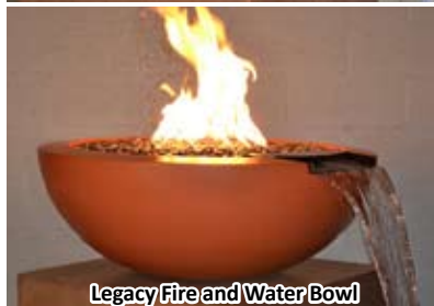
Legacy Fire and Water Bowl