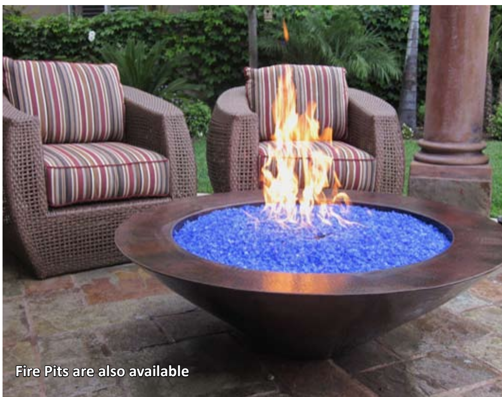
Fire Pits are also available