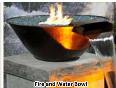
Fire and Water Bowl

Dimensions: 31" Diameter x 11" H x 10" Base