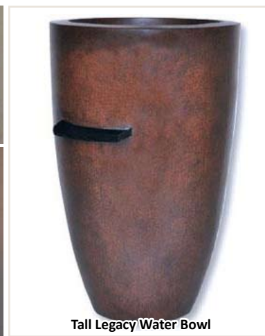
Tall Legacy Water Bowl